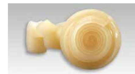
Ceramic button pressed with Alox-plunger