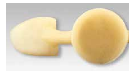
Ceramic button pressed with disposable plunger