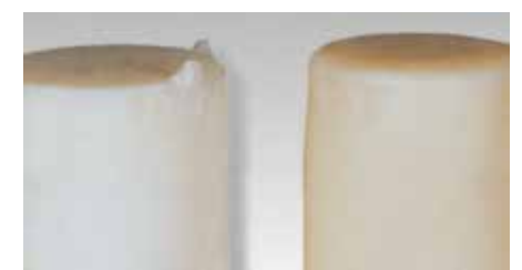
Typical marks of use and potential sources of error with Alox-plungers